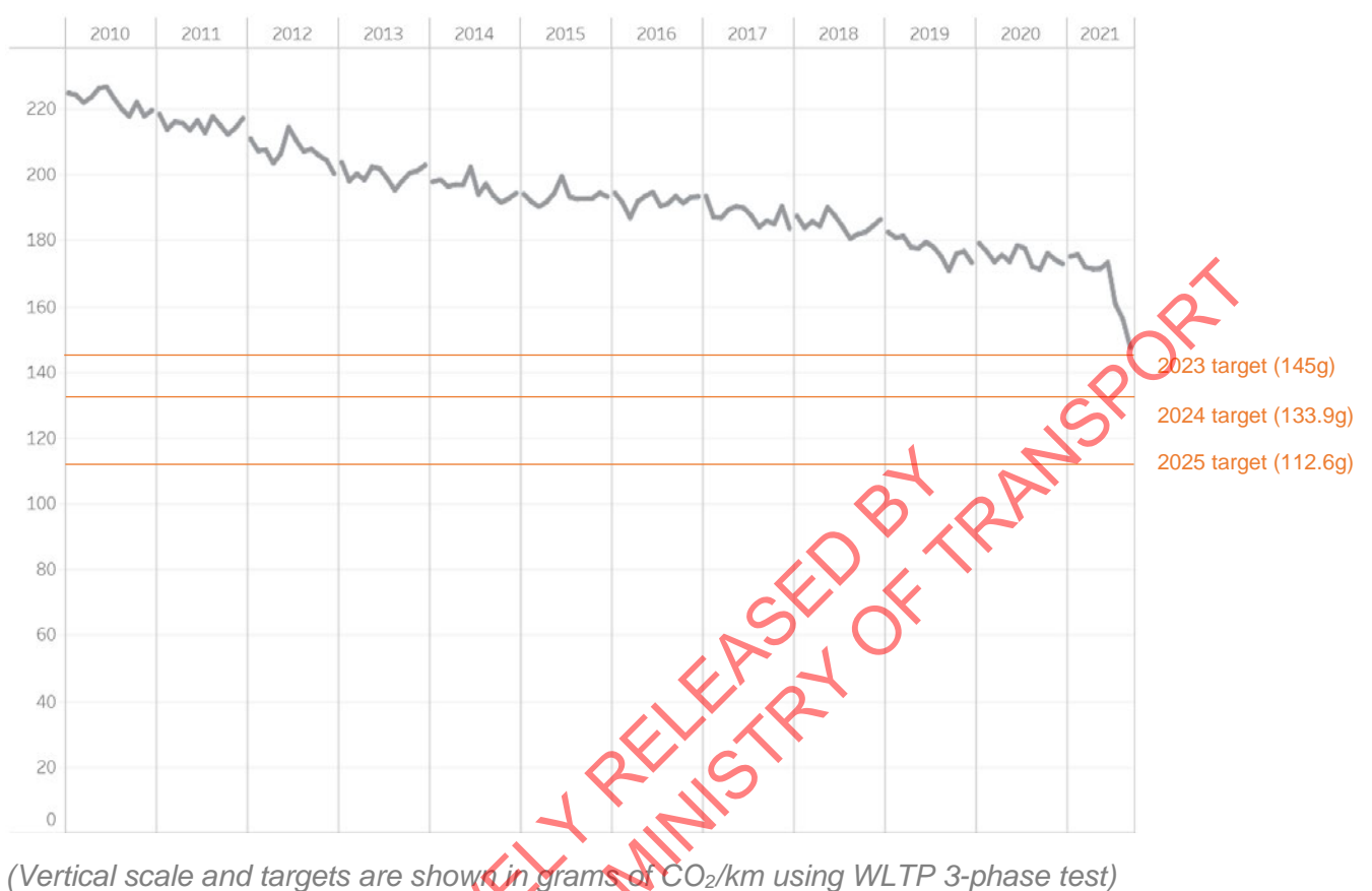
Annex 2 – Average emissions and future targets for brand-new passenger cars